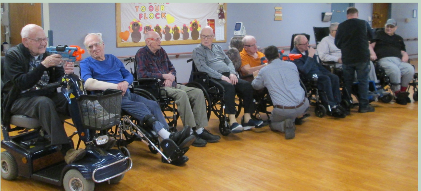
The men gathered for a fun round of Nerf Target shooting in November.