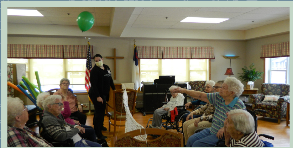
Each week activities and wellness staff come together for a fun active group activity--like balloon volleyball.